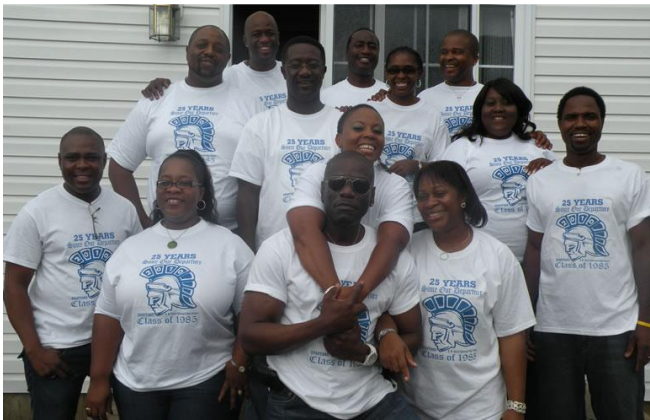
Class of 85- USA

The Class of 1985 of the B.W Harris Episcopal high school celebrated its 25 th class anniversary during the weekend of August 20-23, in Burlington, New Jersey.