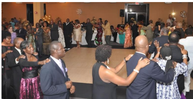
Chairman's Ball 2010- Grand March