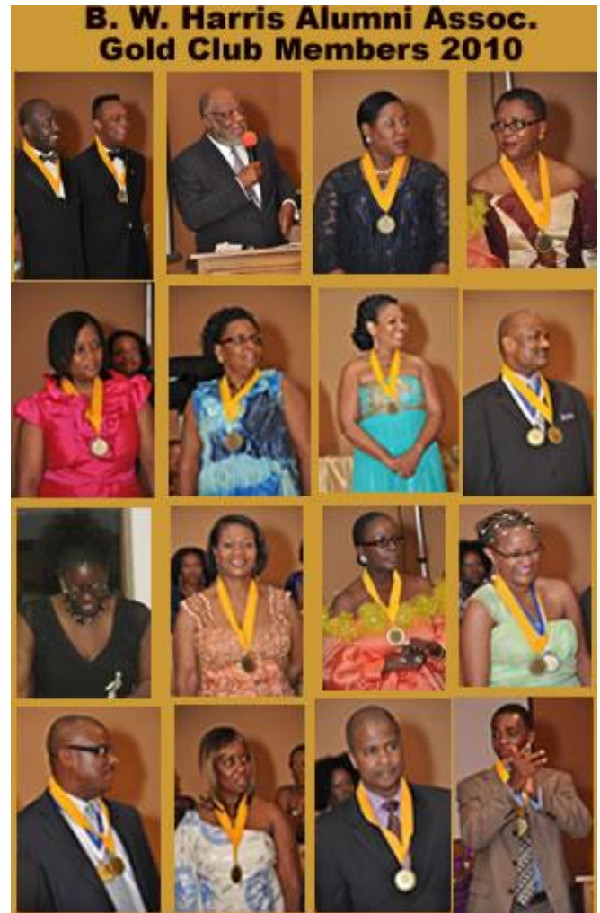
Newly inducted members of the Gold Club