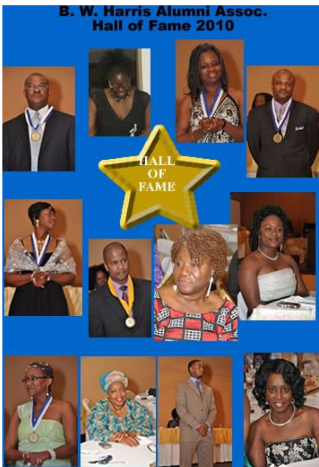
Newly inducted members of the Hall of Fame