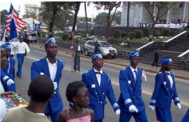
B.W. Harris School students during the parade